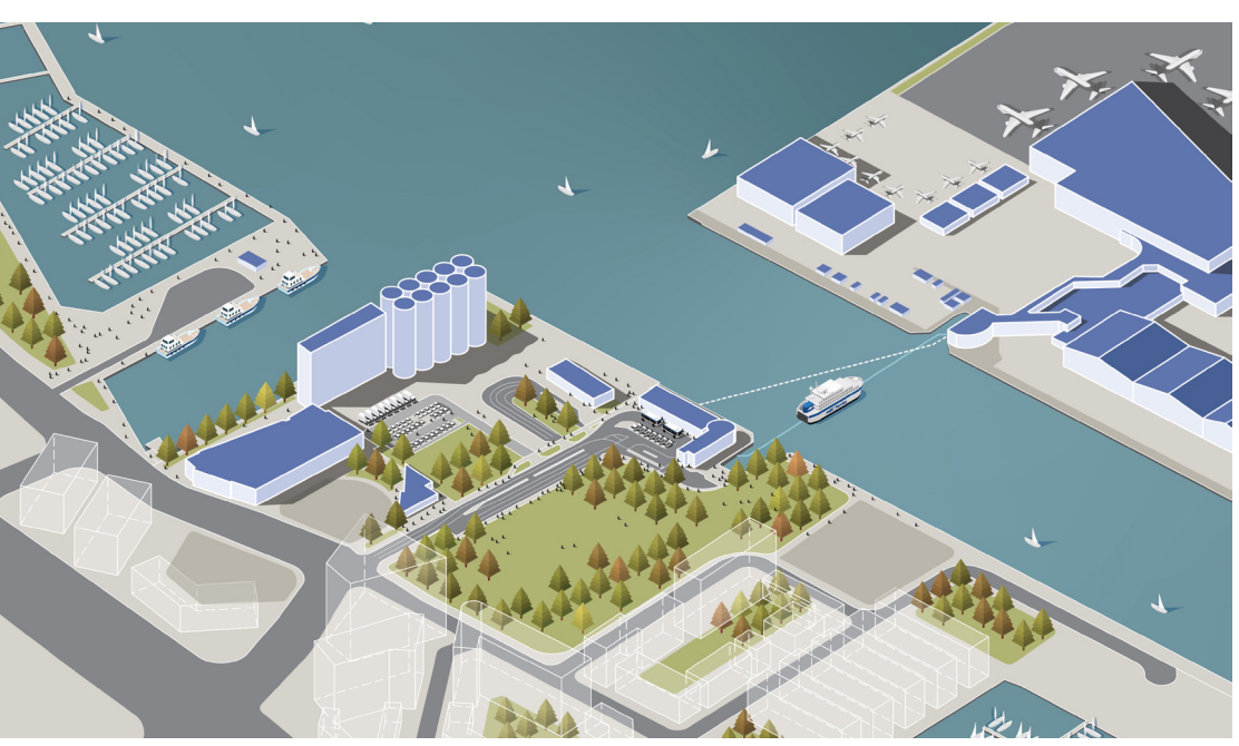
The isometric base of the Billy Bishop airport entry point with the ferry terminal, the illustration helped overlay the strategic planning scenarios.

I contributed to the masterplan development for the university in Central Asia, working under tight deadlines with a larger team based in Istanbul. My role involved creating concept diagrams, 3D models, and illustrations to explain the design ideologies behind three masterplan variations, addressing the project's unique challenges and requirements. We developed three masterplan concepts, the architectural massing, landscape design, and the larger urban strategy.