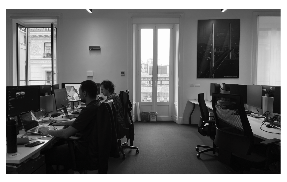
Office bay and the view