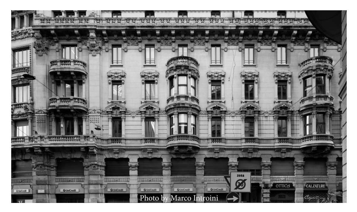
The office is located in the historic Palazzo Meroni building built in the 1900s. The structure features an eclectic style with Art Nouveau and Beaux-Arts influences.