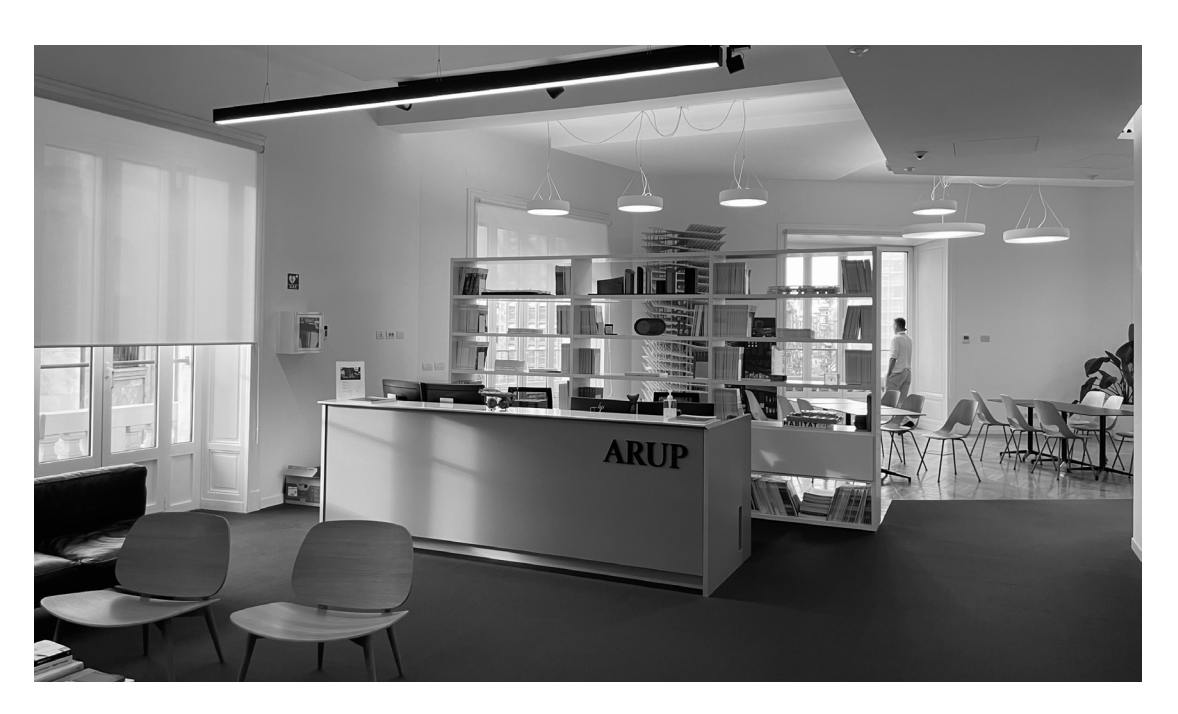
Open office layout with flexible workspaces encourages you to engage in conversations with different teams and helps avoid monotony.